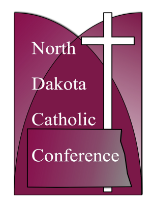
Representing the Diocese of Fargo and the Diocese of Bismarck

103 South Third Street Suite 10 Bismarck ND 58501 701-223-2519 ndcatholic.org ndcatholic@ndcatholic.org