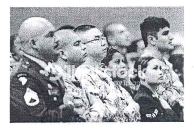
New citizens.

ten years to pass a new law. In December of 1942 Congress passed an amendment that specified that the pledge "should be rendered by standing at attention facing the flag with the right hand over the heart."