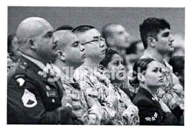
New citizens.

ten years to pass a new law. In December of 1942 Congress passed an amendment that specified that the pledge "should be rendered by standing at attention facing the flag with the right hand over the heart."