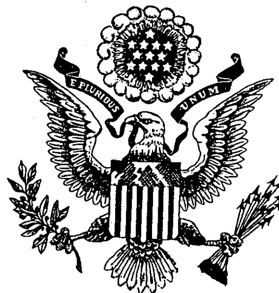
UNITED STATES OF AMERICA Seal of the United States