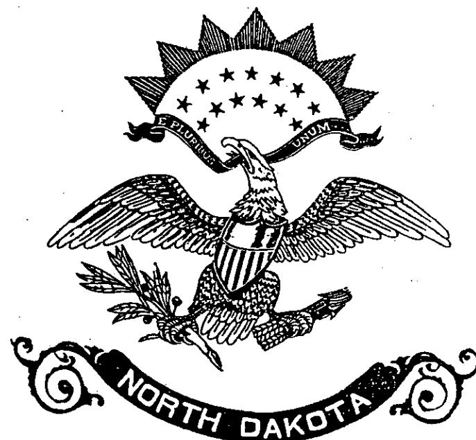
Emblem used on the North Dakota state flag