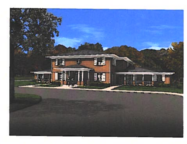
Rendering of Fisher House North Dakota.