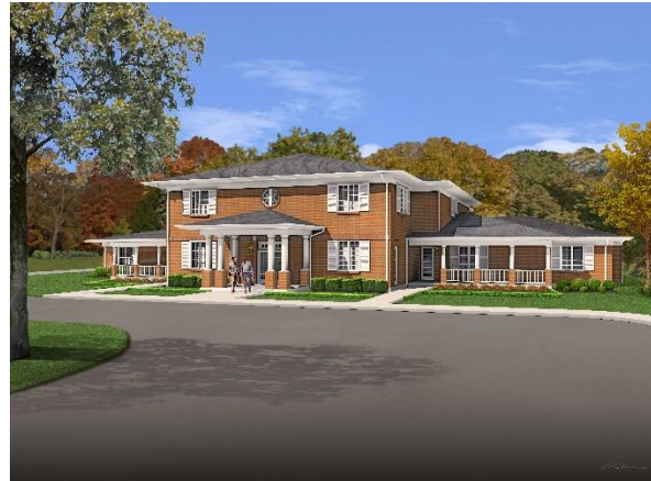
Rendering of Fisher House North Dakota.