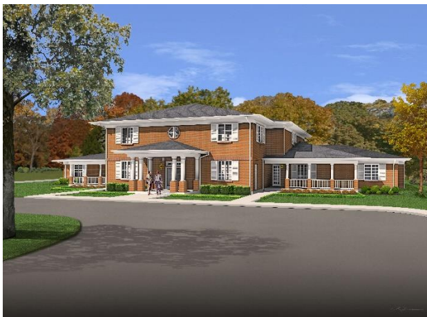
Unofficial rendering of Fisher House ND-reflects local architecture

Federal VA biennium expenditures in North Dakota has surpassed $1 Billion