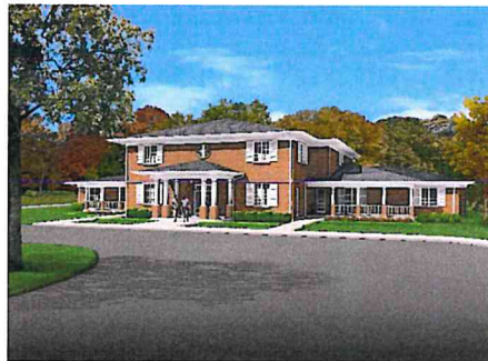
Rendering of Fisher House North Dakota.