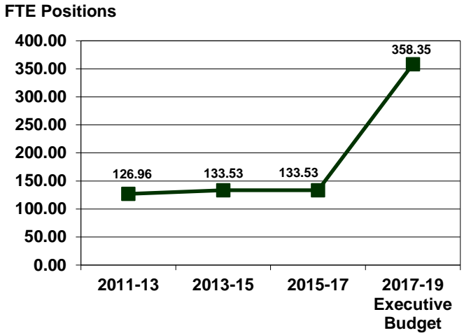
NOTE: The 2017-19 biennium executive budget recommendation includes the appropriation of certain special funds. See the Special Funds Appropriations section below for additional information.